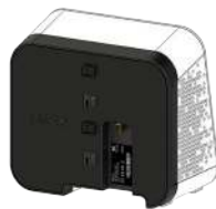
Coverage Unit Adapter attached to Coverage Unit