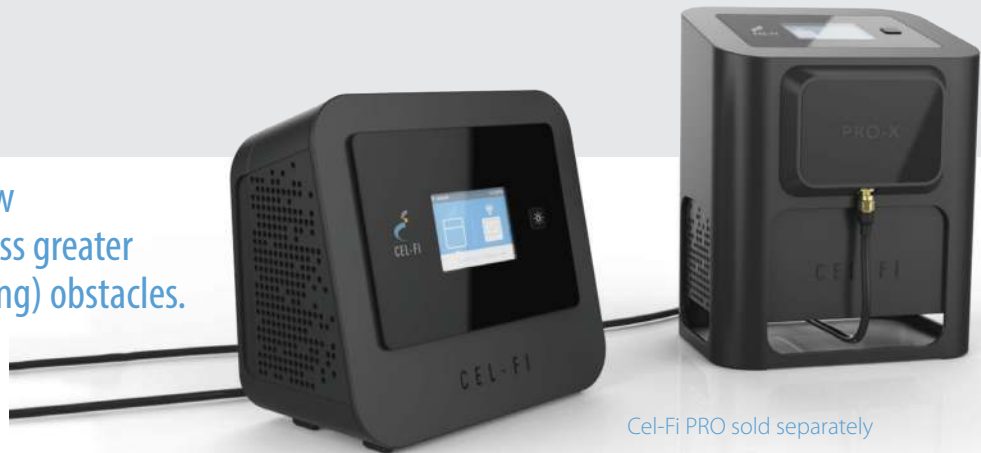
Cel-Fi PRO sold separately

Cable adapter sleeves that allow the Cel-Fi PRO units to link across greater distances or through (RF blocking) obstacles.