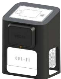
Network Unit Sleeve over the Network Unit